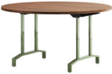
60" Round Folding Levelers or casters available