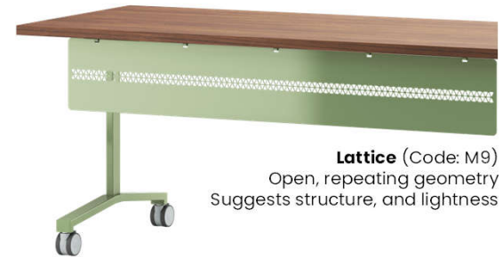
Lattice (Code: M9) Open, repeating geometry Suggests structure, and lightness