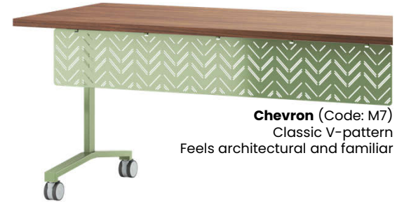
Chevron (Code: M7) Classic V-pattern Feels architectural and familiar