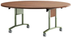
72" Round Nesting Casters are standard (2-person required)