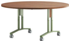
48" and 60" Round Nesting Casters are standard