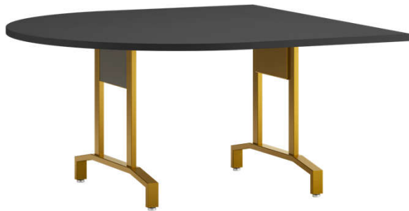
60" x 60" x 29"H D-shaped table (T2 Style Base)