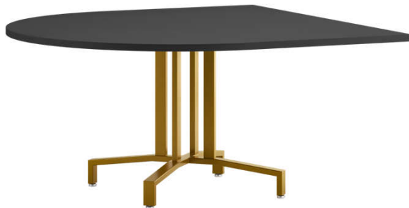
60" x 60" x 29"H D-shaped table (X4 Style Base)