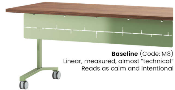
Baseline (Code: M8) Linear, measured, almost "technical" Reads as calm and intentional