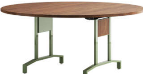
72" Round Folding Levelers or casters available (2-person required)