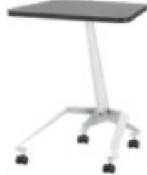
Laminate Top on Casters