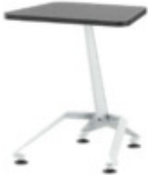
Laminate Top on Levelers