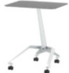
Steel Top on Casters