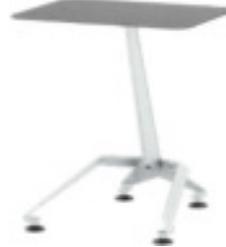
Steel Top on Levelers