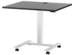
Basic Jewel height range 29" – 47"