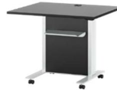
Jewel with Wire Panels & Shelf height range 29" – 47"