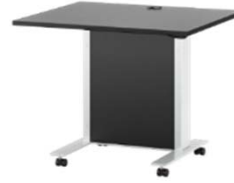
Jewel with Wire Panels height range 29" – 47"