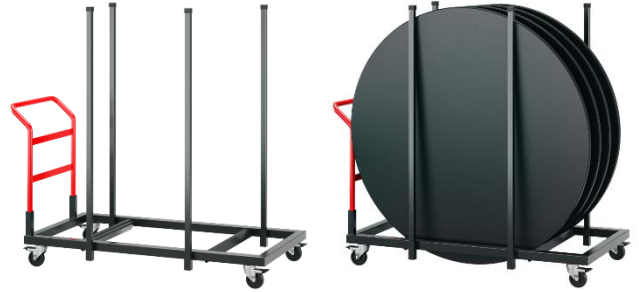
Round Table Cart