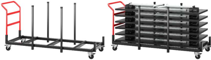
Rectangle Table Cart