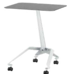
Steel Top on Casters