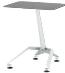
Steel Top on Levelers