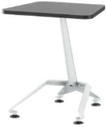
Laminate Top on Levelers