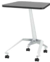
Laminate Top on Casters