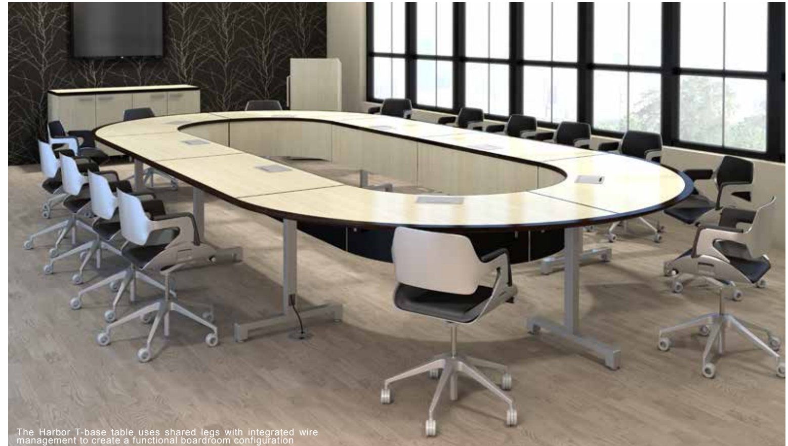
The Harbor T-base table uses shared legs with integrated wire management to create a functional boardroom configuration