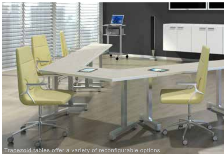
Trapezoid tables offer a variety of reconfigurable options