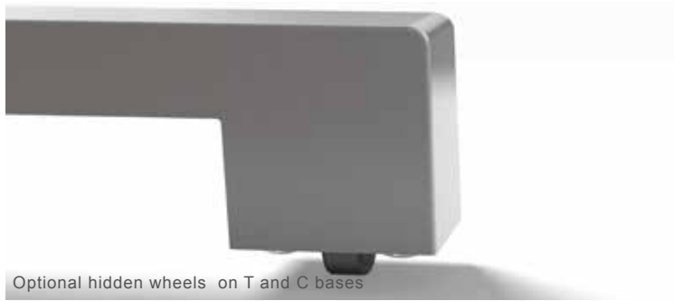
Optional hidden wheels on T and C bases