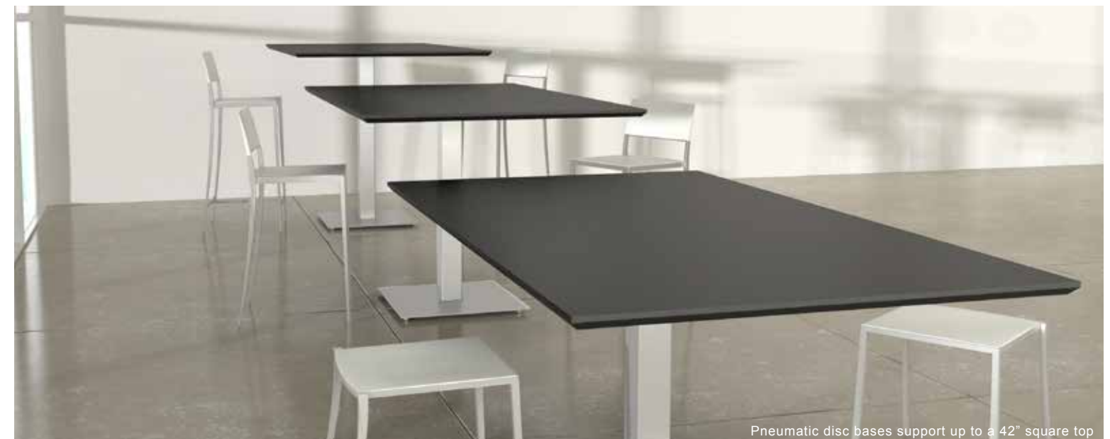
Pneumatic disc bases support up to a 42" square top

The Empire Collection has an extraordinary height range and offers tables with hand-crank, pneumatic, and electric controls. The Empire can be a lounge table for lingering conversations or raise to standing height to keep a five minute sales call on track. The tables are also available in stationary models to coordinate throughout a space.