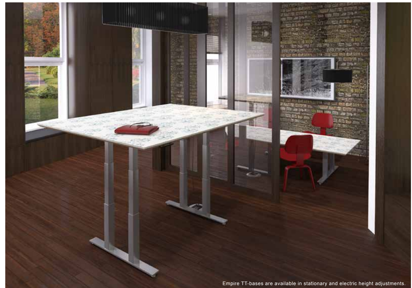
Empire TT-bases are available in stationary and electric height adjustments.