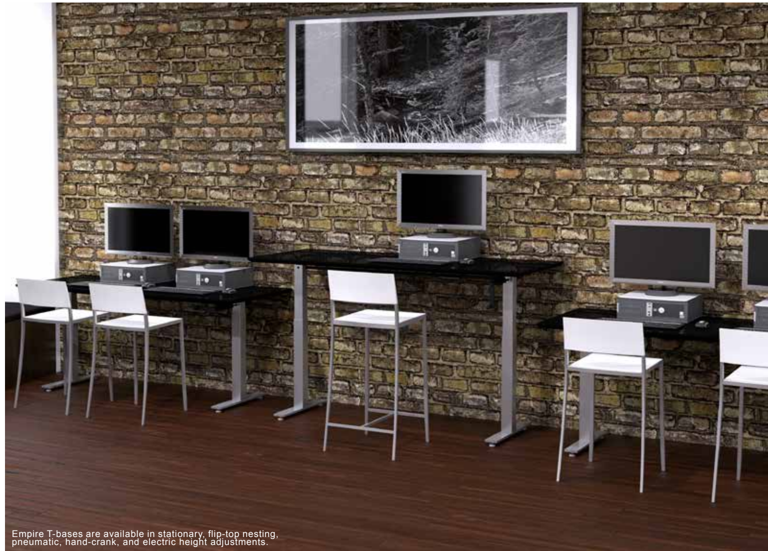
Empire T-bases are available in stationary, flip-top nesting, pneumatic, hand-crank, and electric height adjustments.