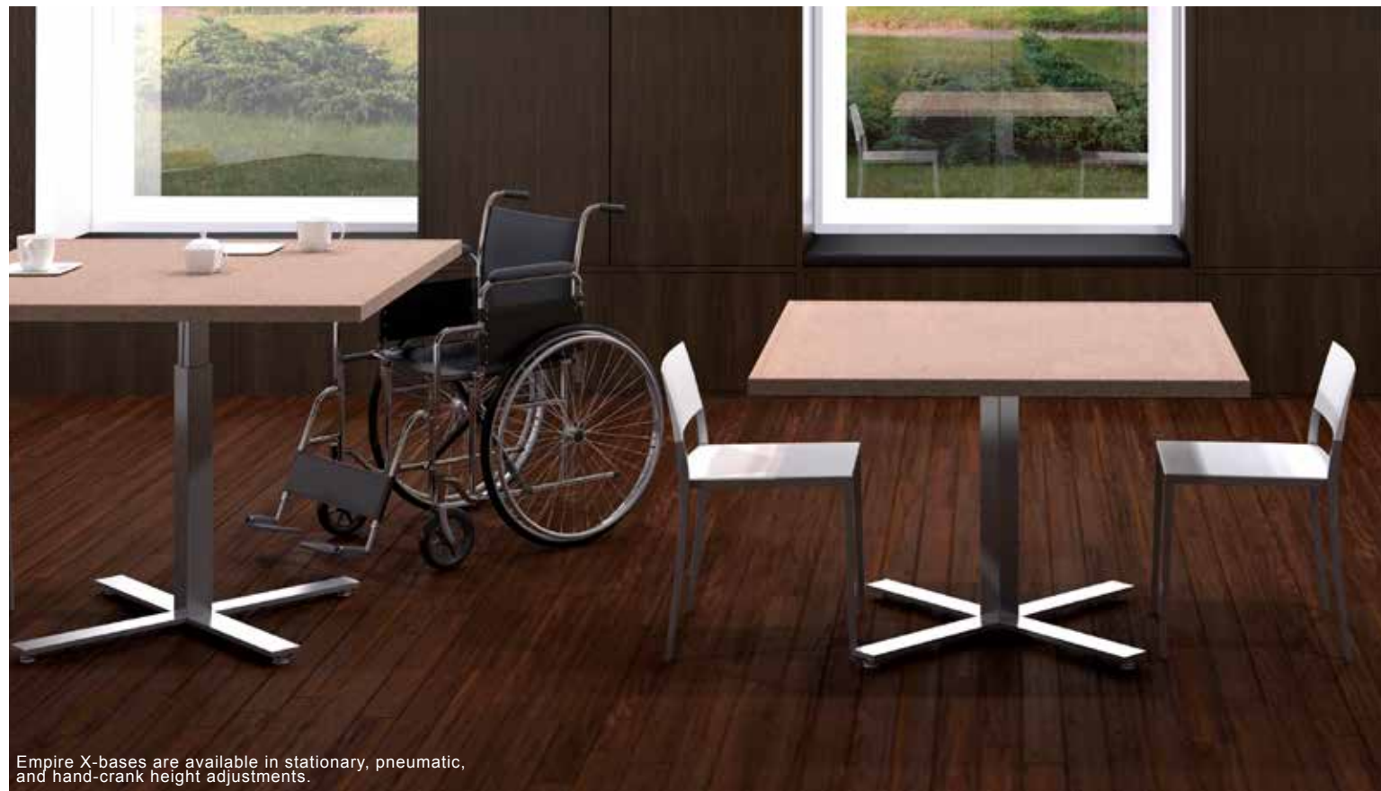
Empire X-bases are available in stationary, pneumatic, and hand-crank height adjustments.